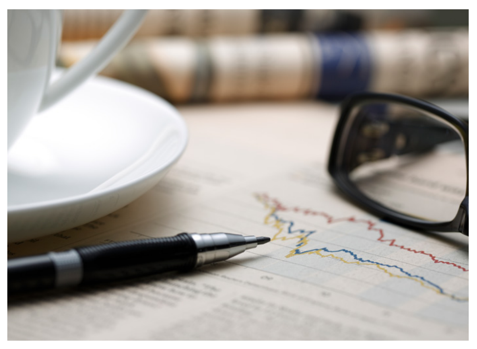
All details are correct at the time of writing (14 Oct 2022).

Financial advice and regular reviews are essential to help position your portfolio in line with your objectives and attitude to risk, and to develop a well-defined investment plan, tailored to your objectives and risk profile.